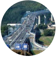
1. Belt Highway Around Prague: Prague Ring (SOKP) Běchovice – Motorway D1 – Slivenec + Traffic Dispatching in Rudna