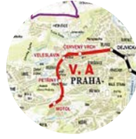
4. Metro Construction in Prague – Line D