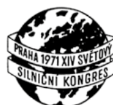
LOGO OF THE XIV TH WORLD ROAD CONGRESS

Strategic Plans covering the period between World Road Congresses, including proposals for individual strategic themes. To address these, it establishes Technical Committees and Task Forces. The results, including the implementation of Strategic Plans, are presented at the end of each four-year period at the World Road Congress.