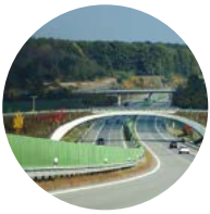
8. Motorway D35: Section Opatovice nad Labem – Vysoké Mýto and Motorway D11: Hradec Králové – Jaroměř – Trutnov – Border Czechia/Poland