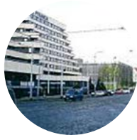
3. Multi-Function Operation Centre Malovanka in Prague