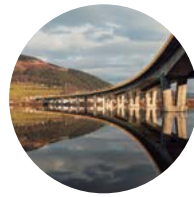
11. Construction of Technically Demanding Road Infrastructure around Žilina (Slovakia)