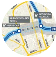
9. Large Motorway Brno Ring: Section Road I/42